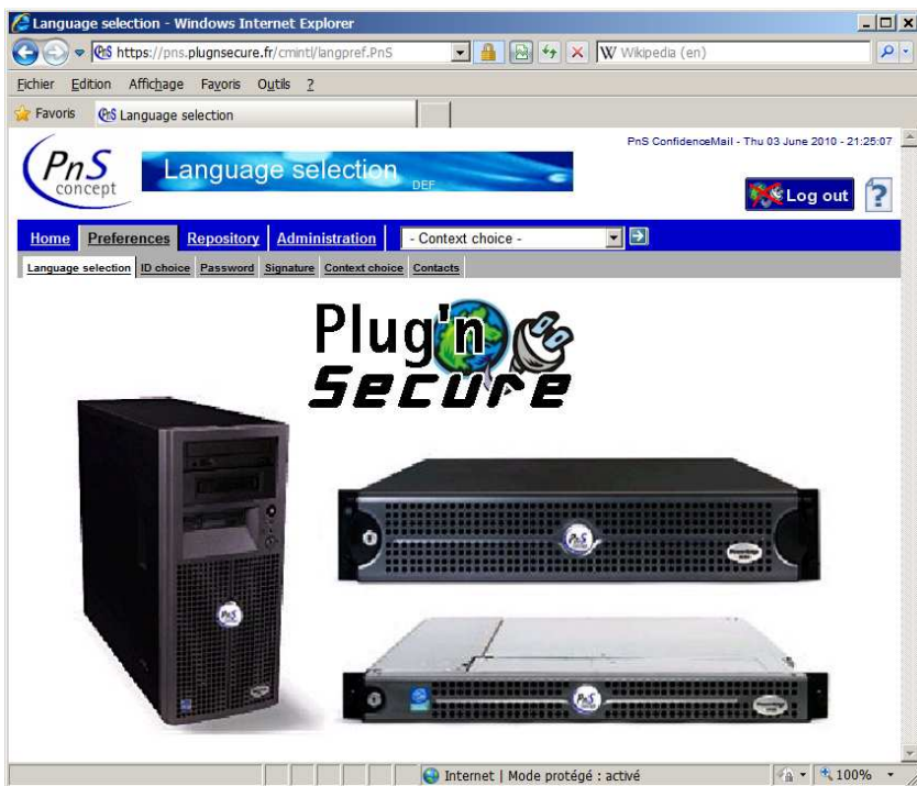
PnS Pack Now you can trust the Internet